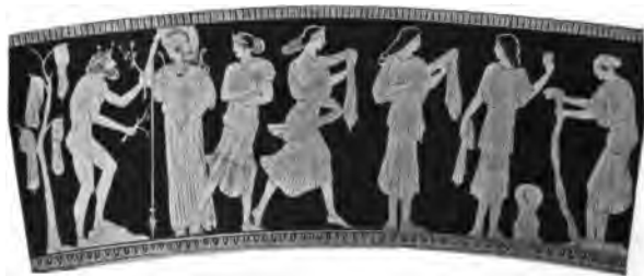
Fig. 94. Odysseus appearing before Nausicaa.

as her husband, the princess felt shy about suggesting wedding preparations, but not wishing to displease the goddess, she modestly asked for the ox-cart that she and her maidens might carry down her brothers' clothes to wash them in the sea. The cart was brought around, the queen packed a basket with bread and honey and wine, and the young girls drove off for the shore. When the clothes had all been washed and spread out in the sun to bleach, they sat down on the